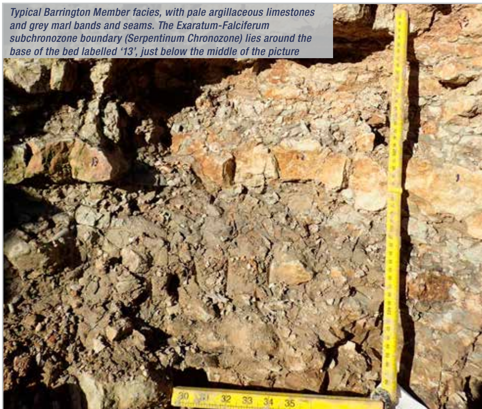
Typical Barrington Member facies, with pale argillaceous limestones and grey marl bands and seams. The Exaratum-Falciferum subchronozone boundary ( Serpentinum Chronozone) lies around the base of the bed labelled '13', just below the middle of the picture