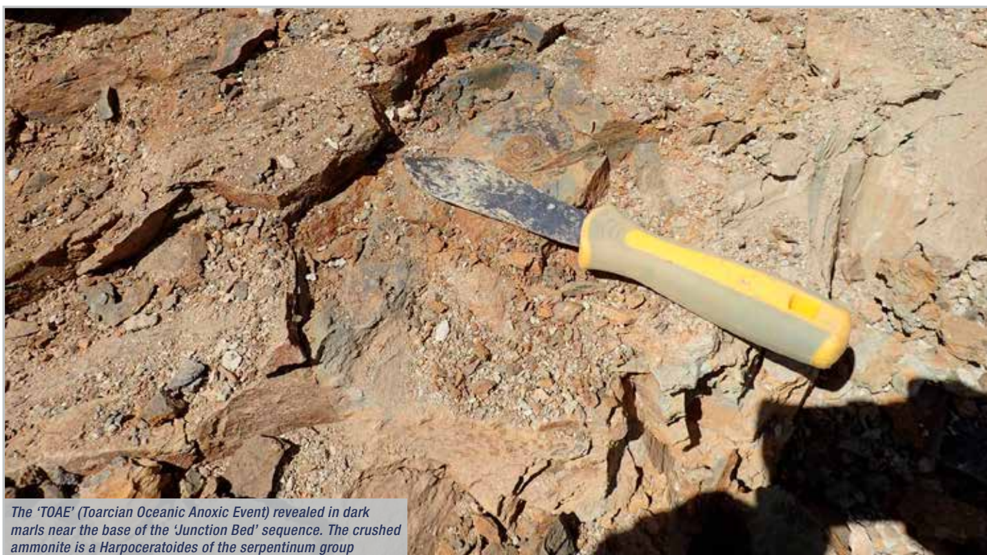
The 'TOAE' (Toarcian Oceanic Anoxic Event) revealed in dark marls near the base of the 'Junction Bed' sequence. The crushed ammonite is a Harpoceratoides of the serpentinum group

The core ammonite sequence is dominated by Submediterranean subfamilies Harpoceratinae and