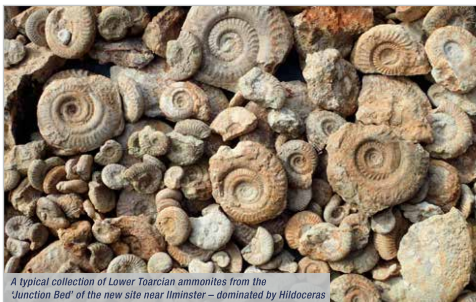
A typical collection of Lower Toarcian ammonites from the 'Junction Bed' of the new site near Ilminster – dominated by Hildoceras